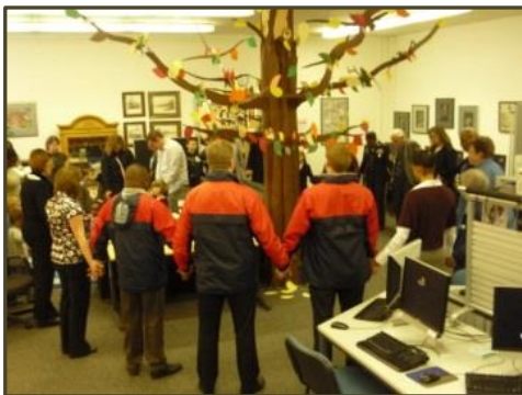
Our Heroes' Tree celebration indoors in winter, Ft. Wainwright, Alaska