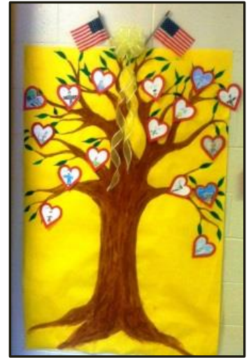
Our Heroes' Tree West Point Elementary School Valentine's Day