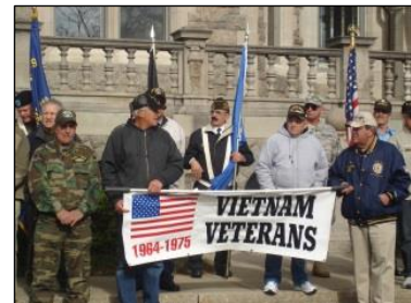
Veterans Day parade Fairhaven, MA hosted Our Heroes' Tree