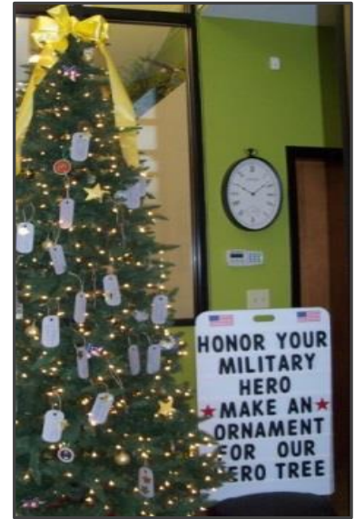
Harrison County Library Corydon, Indiana